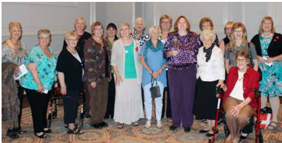
Dagmar Sisterhood Lodge No. 4

The Danish Home Foundation was pleased to honor three distinguished organizations with its 2016 Essence Award. The prestigious honors were presented at The Danish Home's Annual Benefit on September 18th at Drury Lane Theatre. The honorees were Dagmar Sisterhood Lodge No.4, Dania Society and Danish American Athletic Club (DAAC).