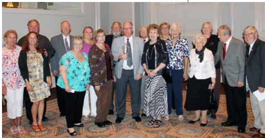
Essence Award recipients Dania Society (above) and DAAC (below)