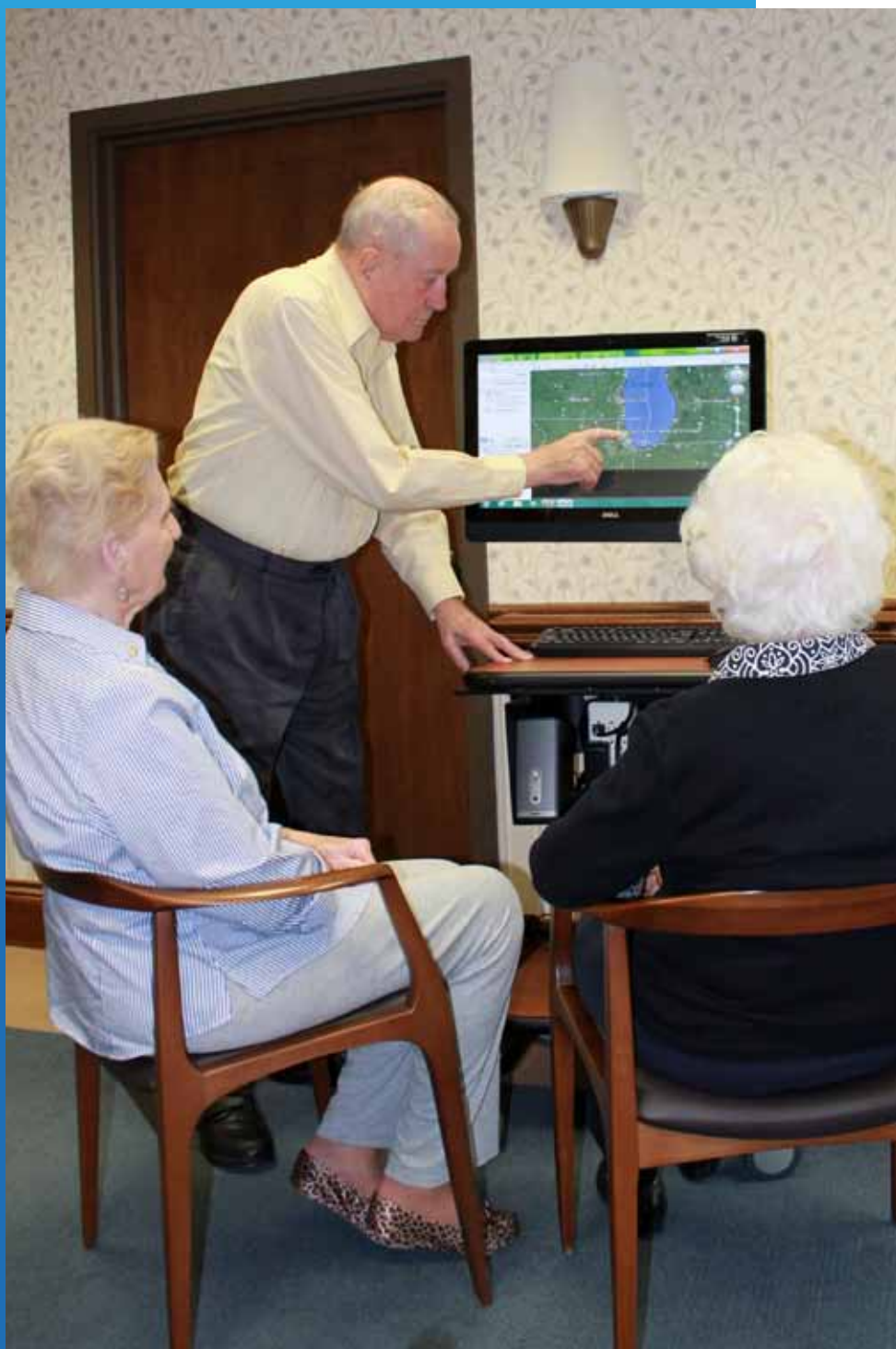
Residents use Google Earth to locate The Danish Home of Chicago.