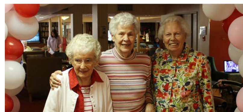
BLUEPRINT FOR FUN The Danish Home engages residents in enjoyable, enriching activities all year long