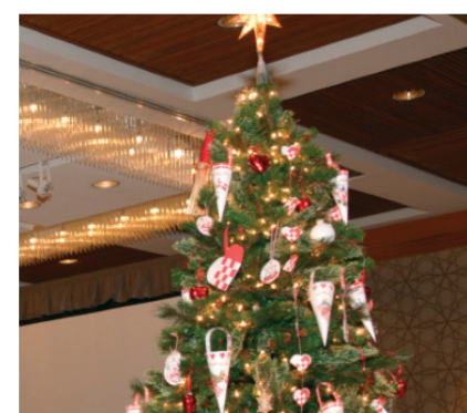
DECK THE HALLS Lillejuleaften, our "Little Christmas Eve," warmed the hearts of young and old