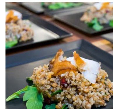
GARDEN VIEWS Our "Cuisine and Corks" annual benefit wined and dined guests under the stars