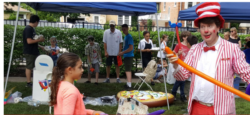
BEAMS OF SUNSHINE We "Chased the Blues Away" at Summerfest