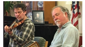
CULTURE IN MOTION Danish artists of all kinds entertained us throughout the year.