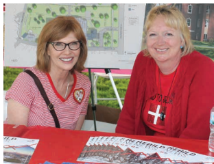
STEPPING INTO FUN We were "A Little Country" at Summerfest